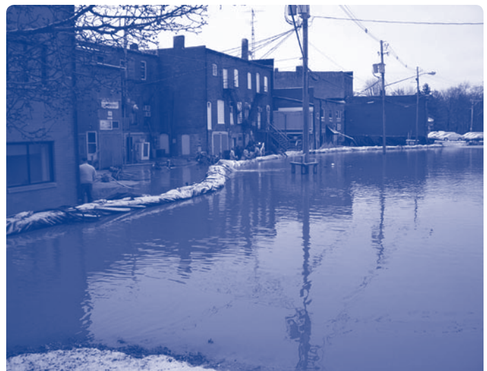
During heavy rains and a melting snow pack in February, the Portage River and Maumee River crested just into the "major flood" category causing flooding issues for homes and businesses in Pemberville (shown above) and Grand Rapids.