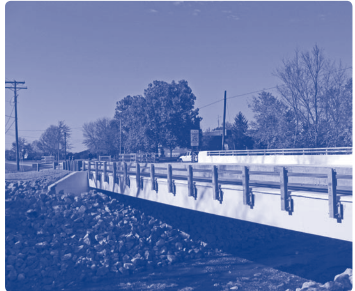
The bridge replacement project on Merrill Road in Milton Township utilized $321,350 of State Issue I funds.